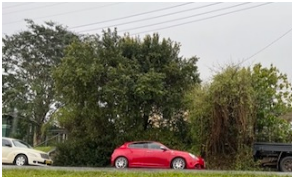
Bank outside medical centre

The approaches to the village are generally not well maintained – these are our entry statements and first point of welcome to visitors. The entry signage currently being produced, and removal of the hoop signs, will help but many roadside signs need cleaning. Areas, including the car park, require more regular attention