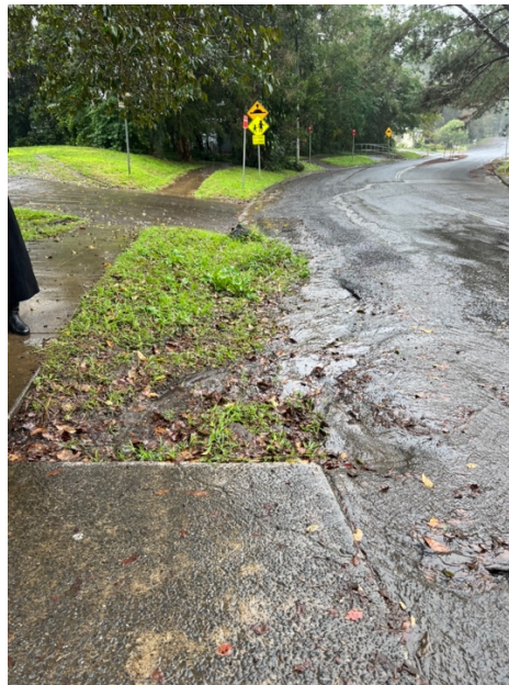
Sibley Street drains are not maintained