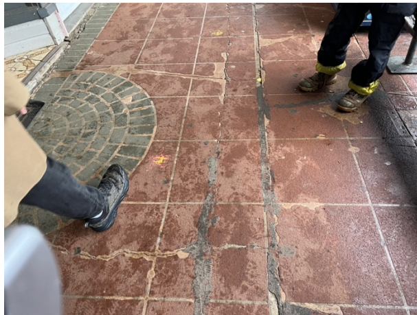
Pavements are in a very poor condition