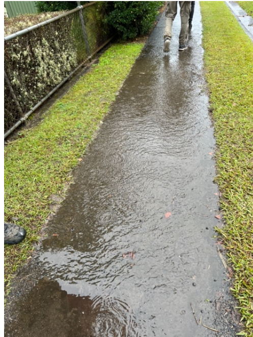
Drainage works well until it meets a blocked drain – then the footpath becomes a rivulet