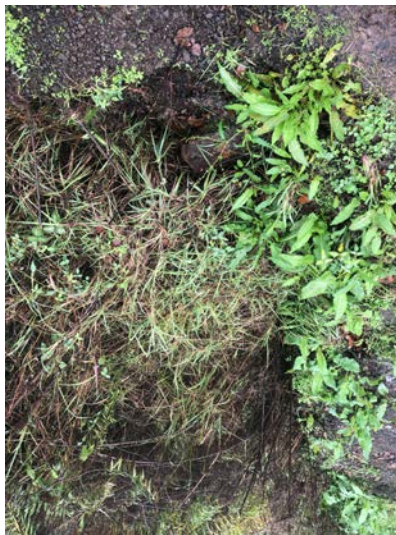
Drains near Bowlo all overgrown. This is most likely road reserve. Their blockage causes the road to flood if more that light rain