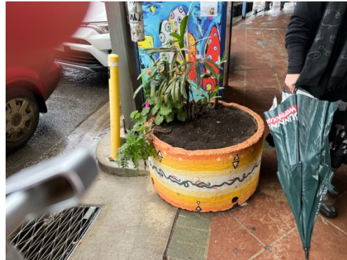
planter pot neglect